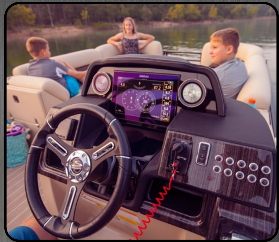
Signature Console with 12" Simrad™ Touch Screen.