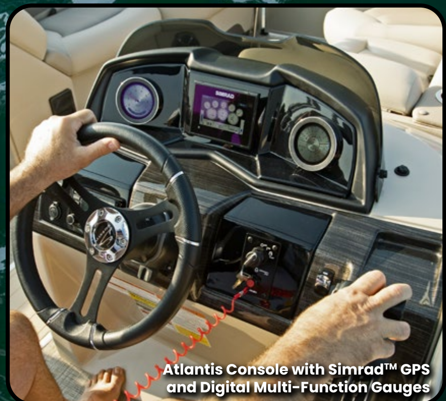
Atlantis Console with Simrad™ GPS and Digital Multi-Function Gauges