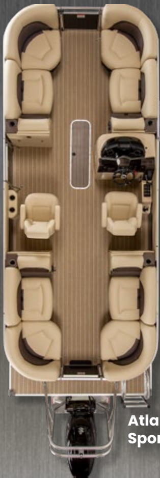
Atlantis 230 Sport Rear Lounge