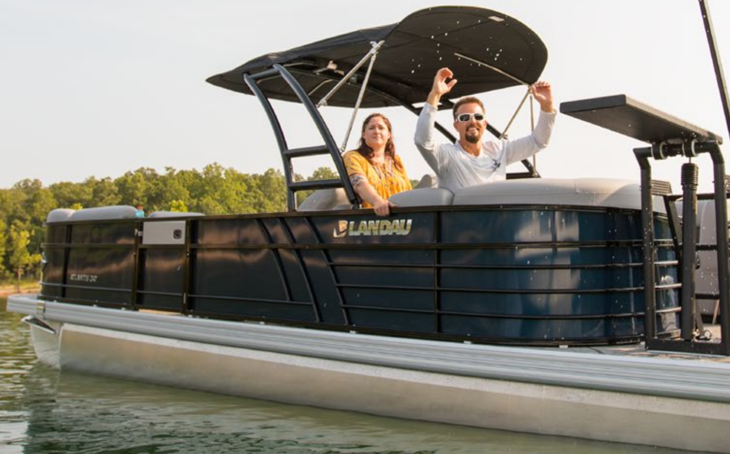
Atlantis 240 Rear Deck Lillipad Diving Board