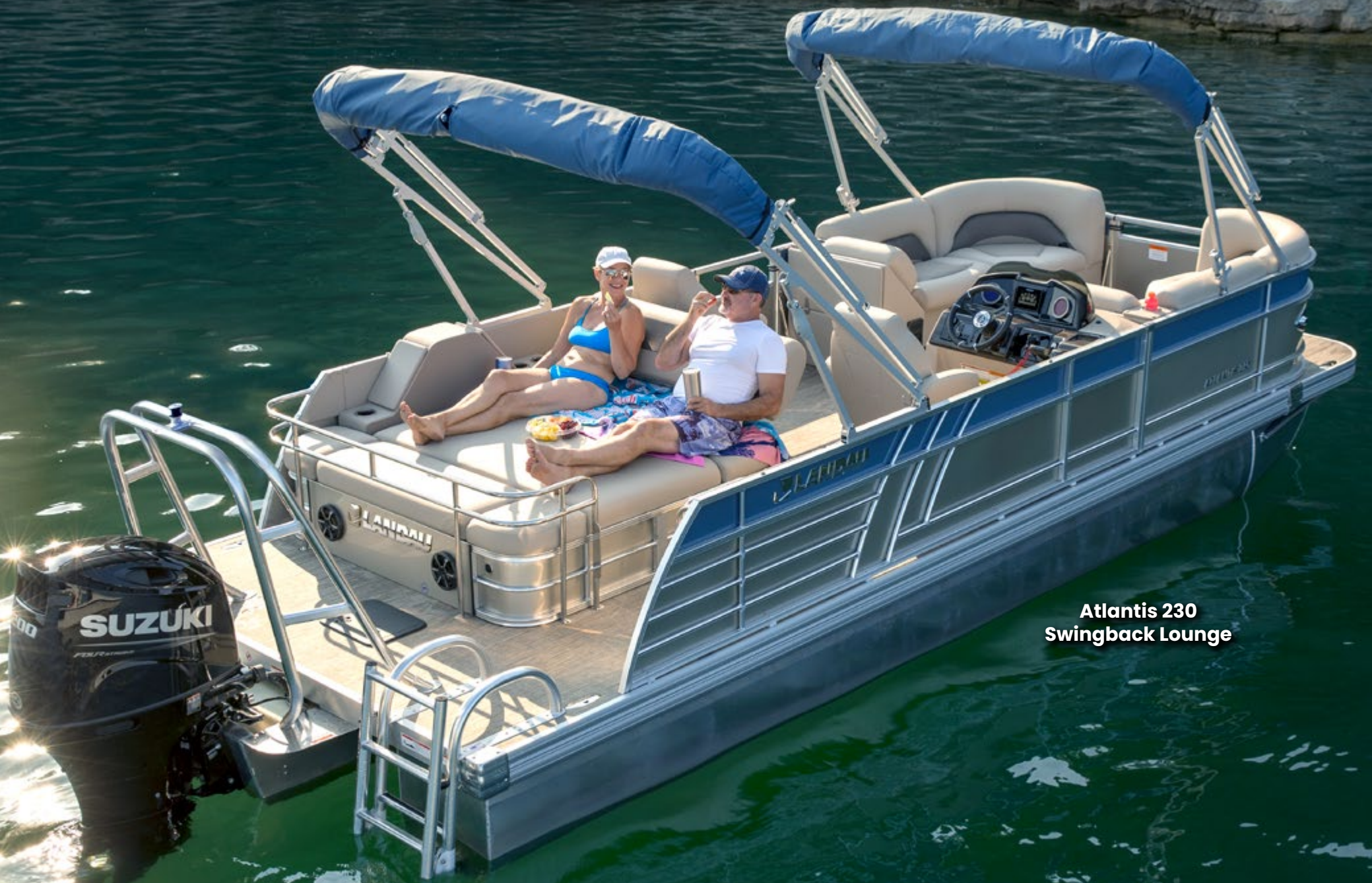
Atlantis 230 Swingback Lounge

An iconic custom-built Atlantis premium cruiser from Landau offers you a true example of luxury, beauty, and convenience. Enjoy water time recreation with a deluxe, feature-rich pilot's console, our exceptional vinyl upholstered furniture, and all the shade you want from your spacious, color-matched bimini top.