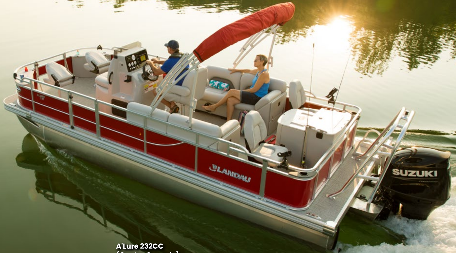
A'Lure 232CC (Center Console)

For those serious about having fun fishing, with perimeter fishing chairs, lounge seats and built-in aerated livewells, these pontoons are ready for a full day on the water. Enjoy a spacious and stable environment to land the trophy of your dreams while soaking up a day on the lake.