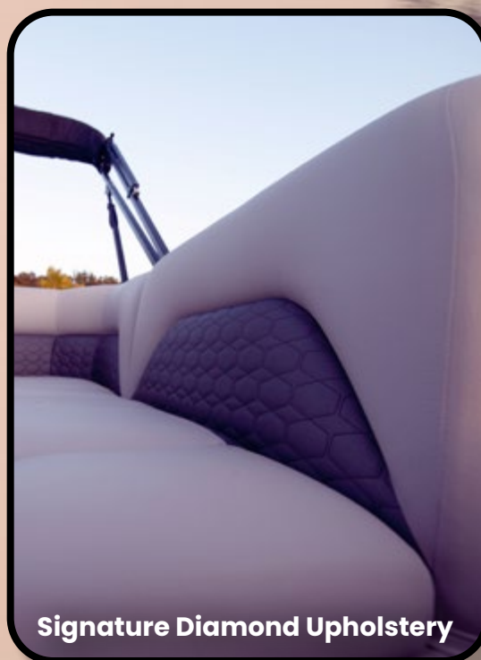
Signature Diamond Upholstery