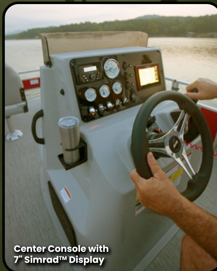
Center Console with 7" Simrad™ Display