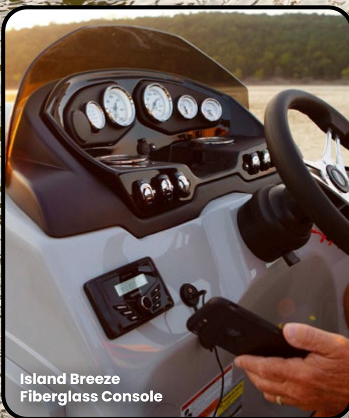
Island Breeze Fiberglass Console