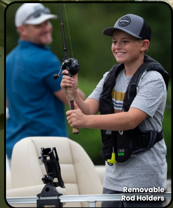
Removable Rod Holders