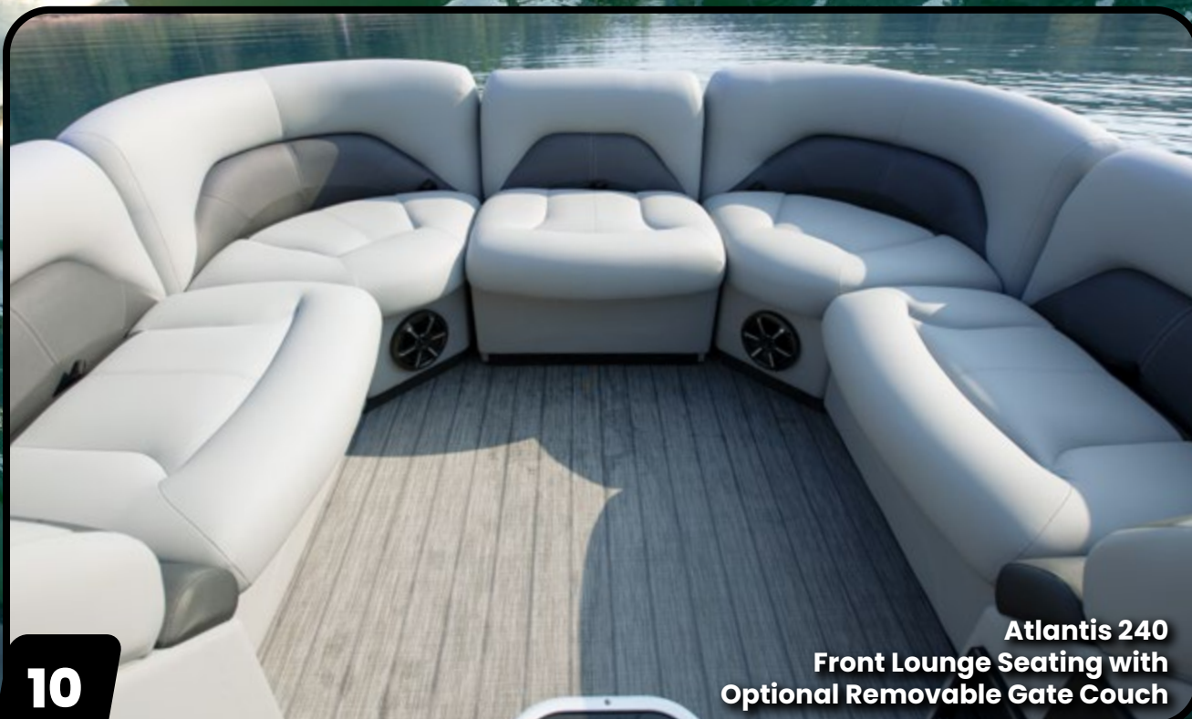
Atlantis 240 Front Lounge Seating with Optional Removable Gate Couch