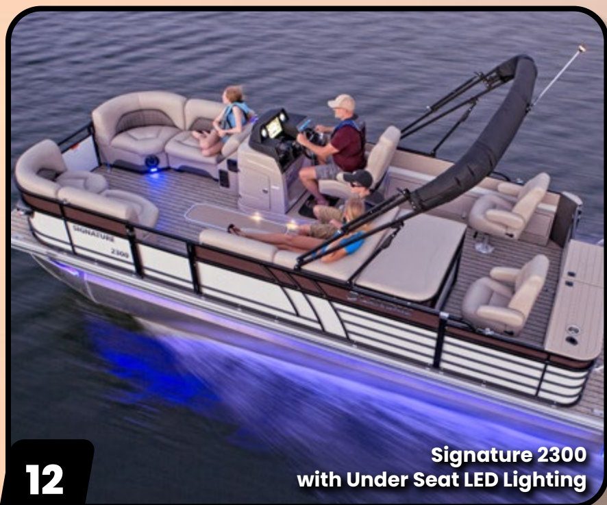
Signature 2300 with Under Seat LED Lighting