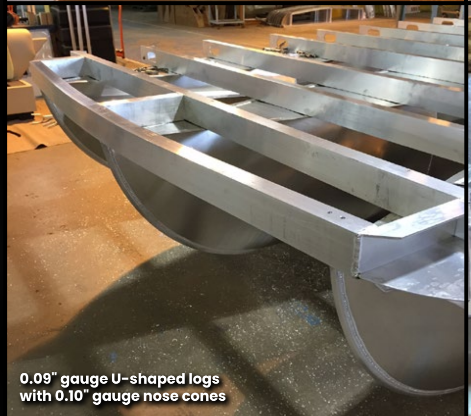
0.09" gauge U-shaped logs with 0.10" gauge nose cones