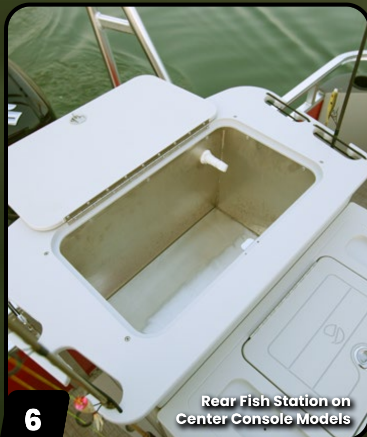
Rear Fish Station on Center Console Models